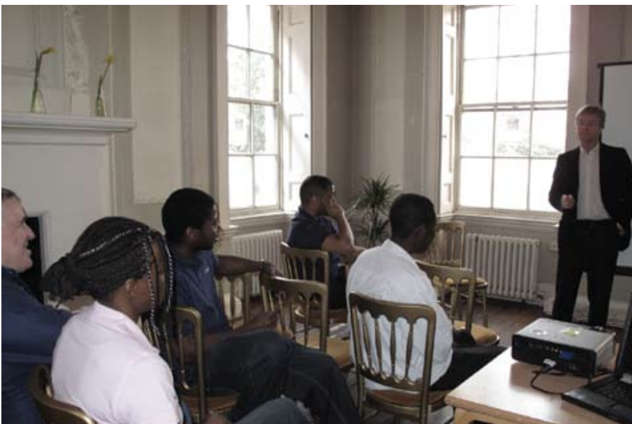
Life Skills classroom

Following a thorough evaluation of our pilot programme we look forward to our first fully fledged programme beginning in the new year and bringing more people through the doors of the House of St. Barnabas in Soho.